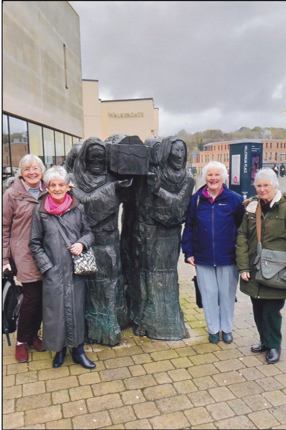
Singles' Circle trip to Durham