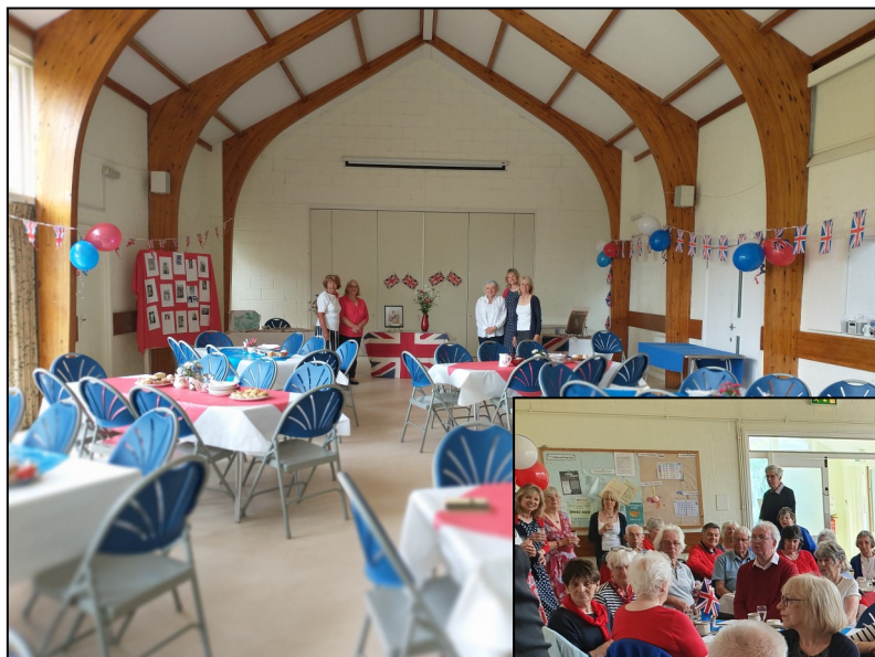
Queen's Jubilee Celebrations