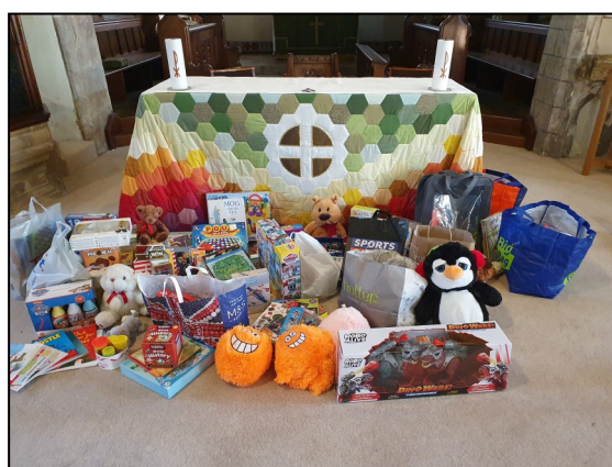
Toy Service Donations in aid of Family Support Work