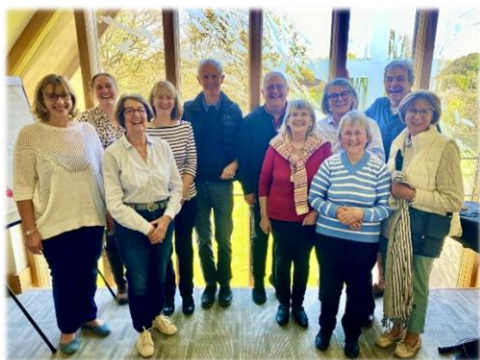
Some members of our two PCCs

Harbour Churches is blessed with many faithful volunteers who carry out a range of vital duties, such as church cleaning, washing church linen, opening and locking the buildings each day, arranging flowers, doing routine inhouse maintenance work, helping with our many church activities, welcoming at services and serving refreshments after services.