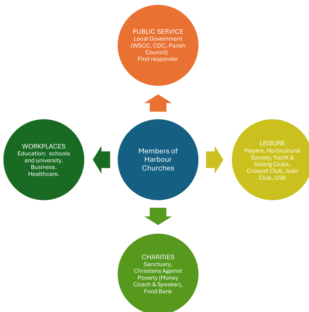
Figure 1: Participation by Harbour Churches in local community

At Harbour Churches we organise a range of activities for our local communities. These will be described in the next section. However, we also engage with our communities through the participation of many congregational members in local community groups or services (see Figure 1 below for examples).