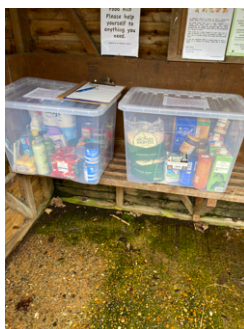
Food boxes in the bus shelter

Over the winter, with the current cost of living crisis affecting many, St Michael's has been running a modest 'Community Larder'. We have been putting non-perishable foods and household items in plastic boxes in the bus shelter near the greatest concentration of social housing and inviting residents to help themselves. We did this because we had become aware that there were individuals and families in need who were too proud or embarrassed to seek the help that was available via the well established Amberley Welfare Trust (which is not run by the church, but the incumbent is an ex-officio trustee). The Community Larder is an experiment that is still being evaluated. It is another tangible way of loving our neighbour.