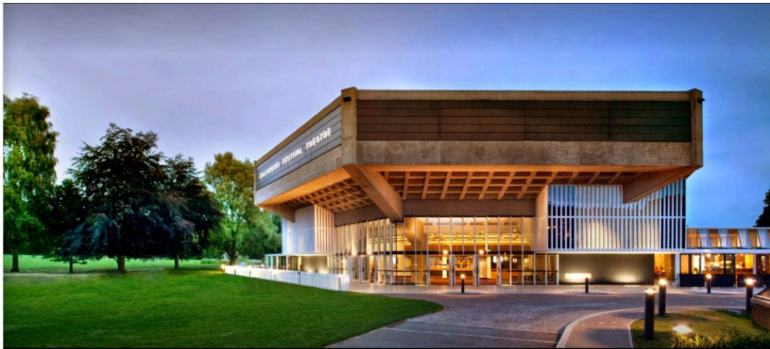
Chichester Festival Theatre

Chichester has good shopping and dining facilities and is home to the world-class Chichester Festival Theatre.