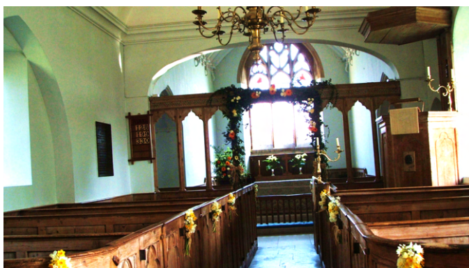
Parham church, interior