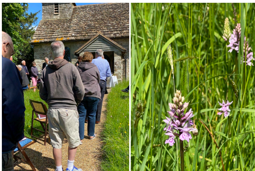
Arriving for an outdoor service at Wiggonholt; and orchids in the churchyard

On occasions when clergy are unavailable, Evensong and Compline Services are led by lay members of Wiggonholt or the Benefice. Ever growing in popularity is an animal blessing service in the churchyard that welcomes all sorts of animals from tortoises to ponies.