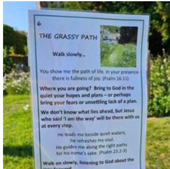
A churchyard trail encourages people to stop, look and listen at various points

Amberley is an ecologically minded community, with its own recycling scheme, repair café and other initiatives, and the Church has been keen to offer support, including hosting a well attended Eco Fair in 2023. Over 20 contributors took part, representing sustainability projects, local produce, wildlife and habitat conservation. Talks in the church plus a wildlife photography competition added to the mix.