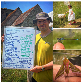
Bug and plant species hunting with Sussex Wildlife Trust at the EcoFair 2023

Amberley is an ecologically minded community, with its own recycling scheme, repair café and other initiatives, and the Church has been keen to offer support, including hosting a well attended Eco Fair in 2023. Over 20 contributors took part, representing sustainability projects, local produce, wildlife and habitat conservation. Talks in the church plus a wildlife photography competition added to the mix.