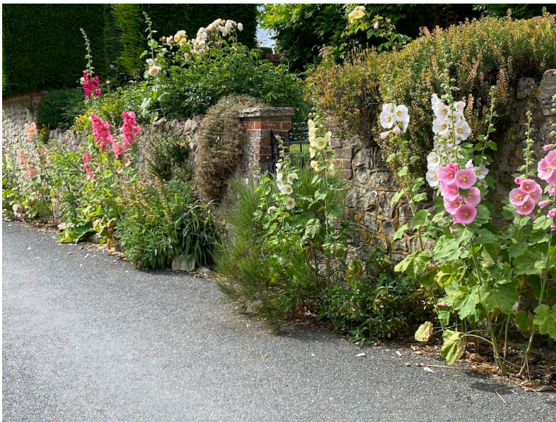
Hollyhocks are encouraged by residents to self seed along the verges

Sometimes referred to as 'The Pearl of Sussex', Amberley attracts a large number of day visitors during the summer months as well as temporary residents staying in the hotel and B&Bs. At major holiday times (Christmas and Easter) numbers are further swelled by those visiting family and friends in the parish.