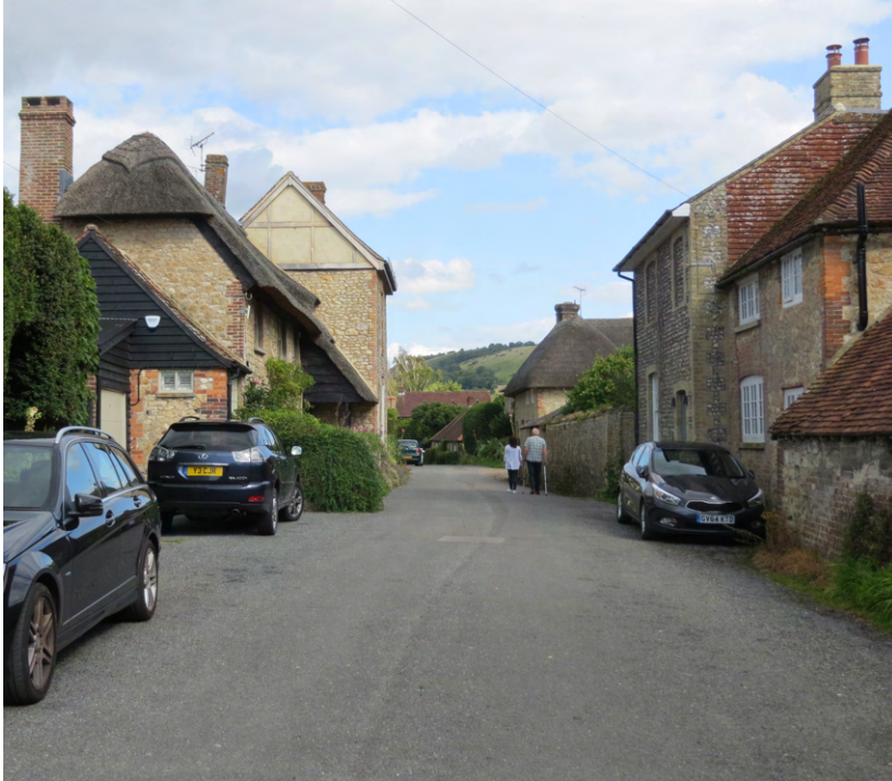
Church Street, looking east towards the South Downs

Sometimes referred to as 'The Pearl of Sussex', Amberley attracts a large number of day visitors during the summer months as well as temporary residents staying in the hotel and B&Bs. At major holiday times (Christmas and Easter) numbers are further swelled by those visiting family and friends in the parish.