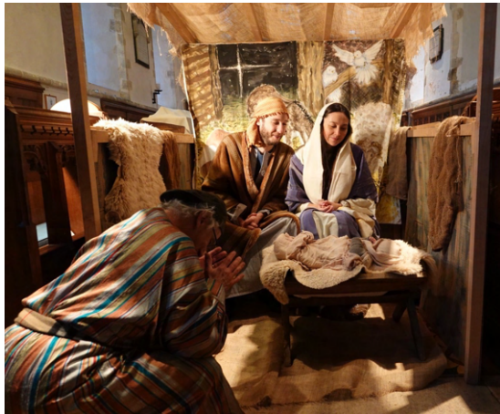
...ending up in the church with a living tableau of the holy family in the stable