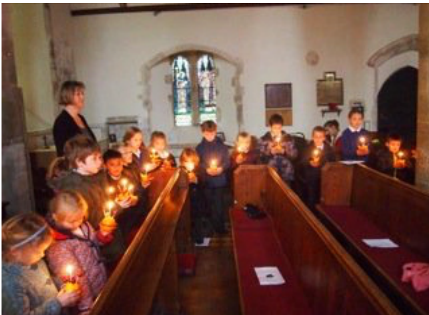
The children at a Christingle service in the church

The church provides flowers for the children to make posies for Mothering Sunday. They receive Easter Eggs and booklets about the meaning of Easter, a small gift at Christmas and leavers receive a Bible at the end of year service.