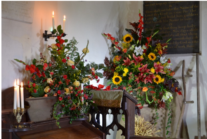
Wiggonholt Parish Church's flower festival held in support of the Pulborough Heritage Weekend

choose to attend there because of the special qualities of the church's environment and the nature of the services.