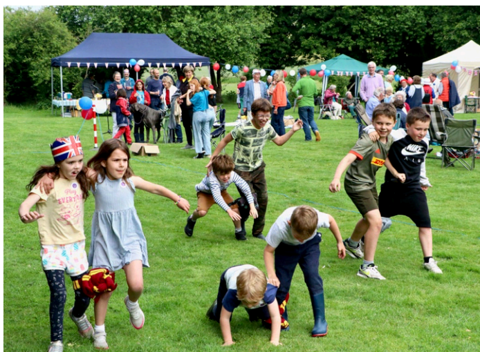
The 2022 Platinum Jubilee provided an opportunity for St Michael's PEG group to organize a celebration that attracted young and old. Prayers for the Queen reminded us of her late Majesty's strong faith.