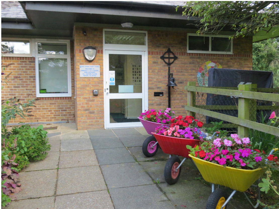
Amberley School's welcoming entrance

Amberley Primary School is Church of England Voluntary Controlled.