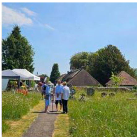
Stalls in the churchyard and church hall