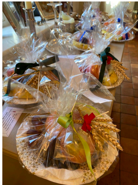
Harvest gifts ready to be taken to elderly or ill residents

Over the winter, with the current cost of living crisis affecting many, St Michael's has been running a modest 'Community Larder'. We have been putting non-perishable foods and household items in plastic boxes in the bus shelter near the greatest concentration of social housing and inviting residents to help themselves. We did this because we had become aware that there were individuals and families in need who were too proud or embarrassed to seek the help that was available via the well established Amberley Welfare Trust (which is not run by the church, but the incumbent is an ex-officio trustee). The Community Larder is an experiment that is still being evaluated. It is another tangible way of loving our neighbour.