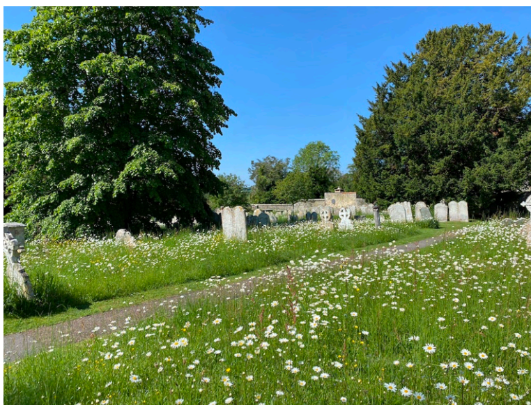
The churchyard in June

St Michael's has received a Bronze 'A Rocha' award in and is working towards silver. The building itself presents challenges to sustainability: in common with many churches it is poorly insulated and expensive to heat. But the churchyard is actively managed for biodiversity and at the last count in 2023 contained at least 167 plant species. The number will continue to grow as appropriate new species are introduced.