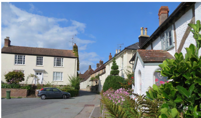
Amberley High Street

Of the four ecclesiastical parishes that make up the Benefice, Amberley-with-North Stoke is the largest and the only one with a nuclear village.