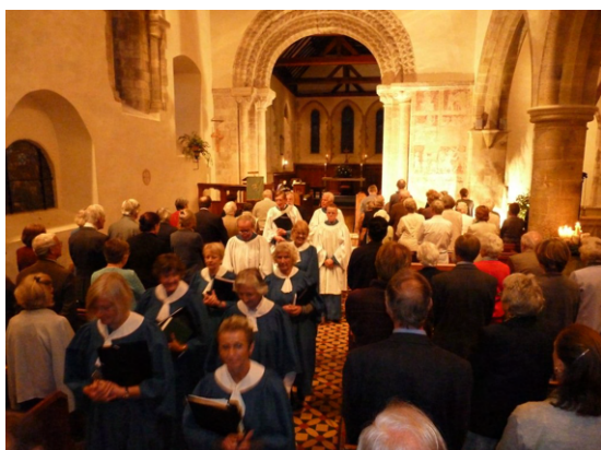
A service at St Michael's

The church has an unusual anticlockwise ring of 5 bells (all cast at the same time) with a dedicated band of ringers.