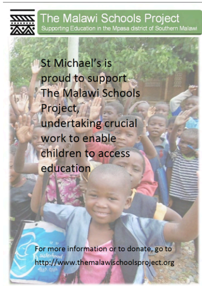
Malawi Schools Project; a charity started by an Amberley resident to bring education and other benefits to children in a very poor rural part of Malawi http://www.themalawischoolsproject.org

As regards outside charities, St Michael's has supported, by donating collections or by hosting fundraising events: The Ukraine Appeal and local Ukrainian refugee families; Tearfund, The British Legion; Combat Stress; The Malawi Schools Project and The Lorica Trust, the last two being locally run.