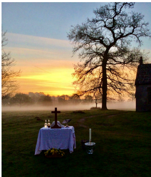
Easter Sunrise service, Parham churchyard

In recent years a tradition of Easter Day Sunrise Communion has been established, held outside the church against the backdrop of the house and Downs. The PCC would love this to continue.