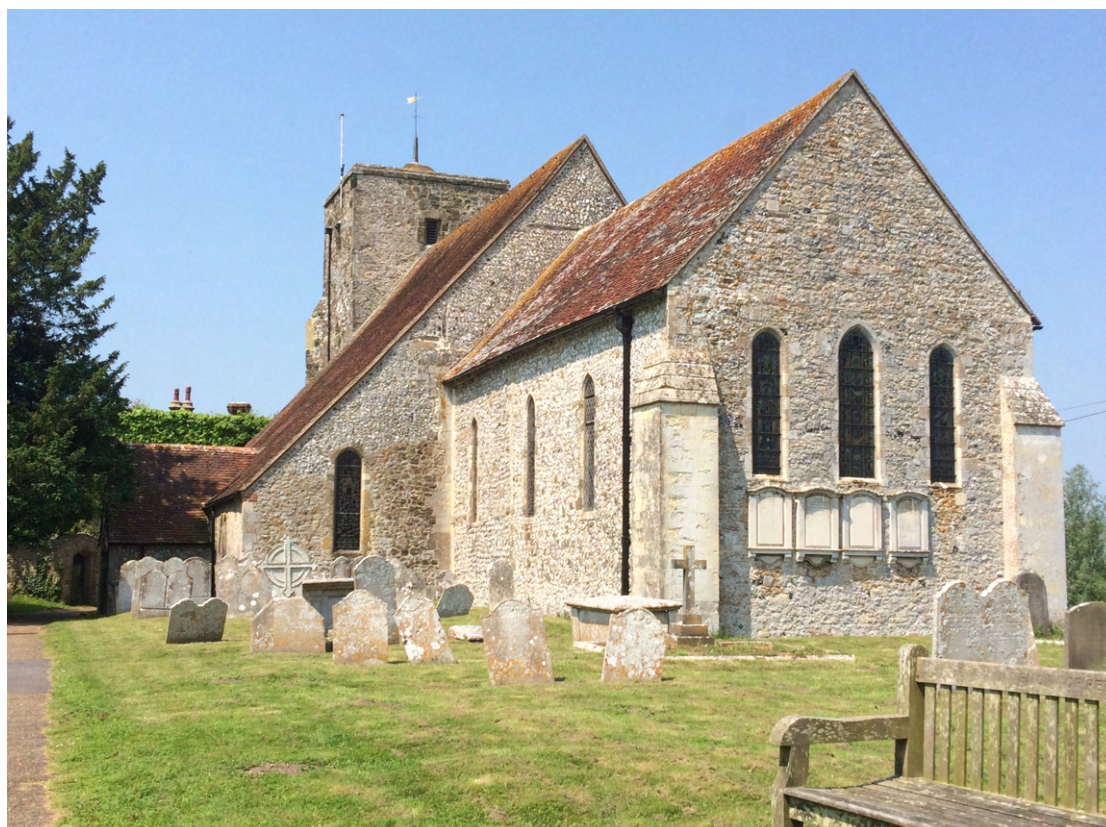
St Michael's Amberley

The Grade I listed St Michael's church was re-built during the twelfth century by the Normans and still boasts a typically Norman chancel arch. It retains a few faded wall paintings. Seating about 120, it is popular for weddings and for blessings of civil marriages celebrated at the Castle.