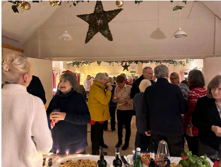
'Round Europe Christmas' – a fundraiser in the church hall

Rackham Old School, not belonging to the churches but available to hire at very reasonable rates, provides another community space for the Benefice.