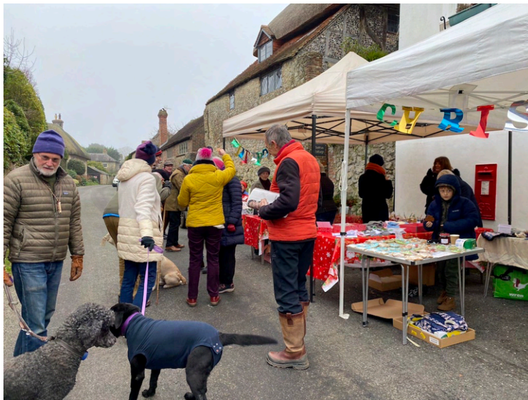
Christmas Stall in The Square, Amberley

Wiggonholt has successfully raised funds for the restoration of its remarkable lychgate. Parham is raising funds for building repairs and Greatham also holds occasional fundraising events.