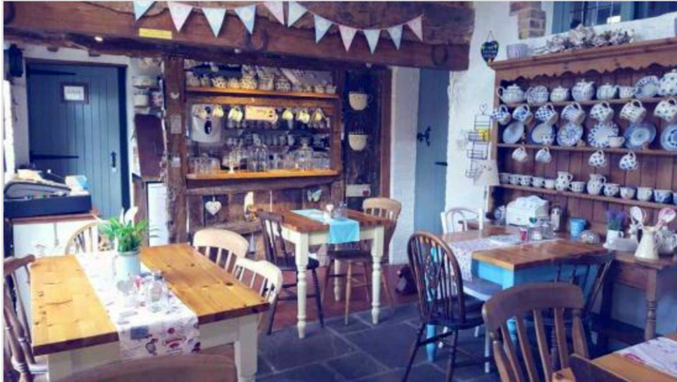
Amberley Village Tea Room

There are good road and rail links to London and along the south coast, with a railway station on the outskirts of Amberley.