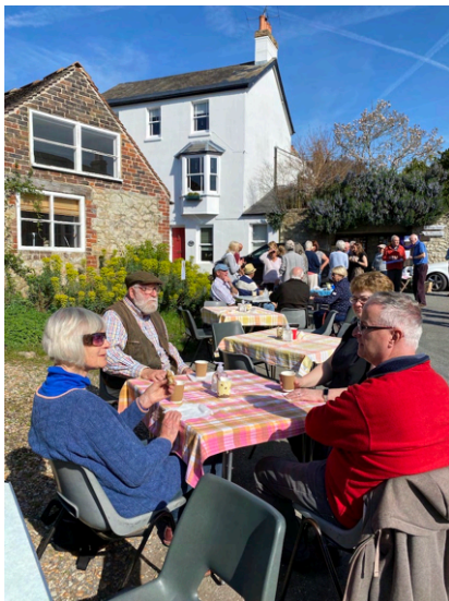
People (and cheeky dogs) enjoying 'Buns in The Square' on Good Friday: an opportunity for outreach.