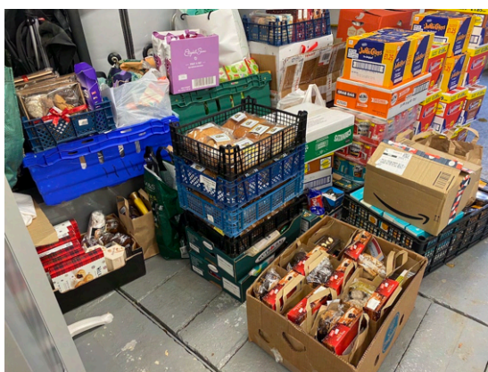
Some of the supplies ready to go off to Family Support Work before Christmas 2023 www.familysupportwork.org .

In addition St Michael's organizes several collections a year for the Diocesan charity Family Support Work. These collections are very generously supported by Amberley Village Stores and the wider community, and also by Wiggonholt church. St Michael's also holds a Gift Service for FSW before Christmas.