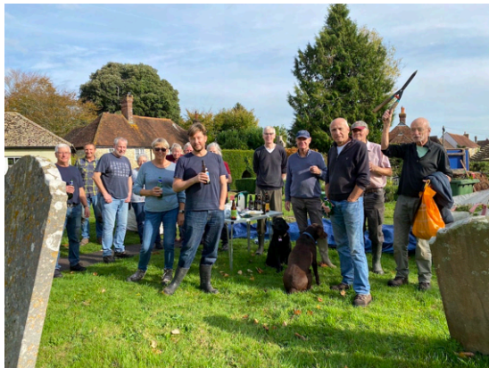
Volunteers relaxing after a churchyard working party

Benefice magazine, fundraising, flower arranging, locking and unlocking the church and helping in the churchyard, to mention just a few.