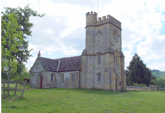
St Peter's Parham

We do not know when the first church was built here in Parham, but the list of rectors goes back to 1148. The church is now dedicated to St Peter.