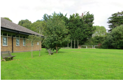
School Playing Field

The school is at the heart of the local community and has strong links with the Church. The pupils plan and take an active part in services during the Christian Calendar Year. These include Harvest Festival, Christmas Services, Mothering Sunday and Easter Services. These services are well attended by parents, younger siblings and carers.