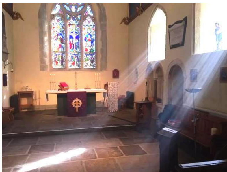
The Chancel, St Peter's