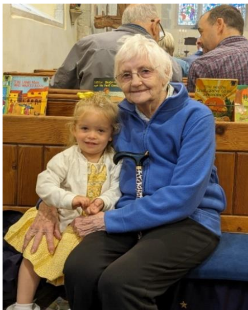
Friendship between young and old!

Whilst our ancient building is beautiful, it does create challenges to welcoming and accommodating families with young children, people with disabilities, and those who are vulnerable – and for this reason the Lady Chapel was created for greater access. However, we now find that the space created is insufficient for those needing to use it and further development will need to be explored. There are large print versions of the weekly bulletin and hymn books and children's toys and books available. We have been blessed by the arrival of new parishioners, some finding us online, some by word of mouth and others by moving into the area