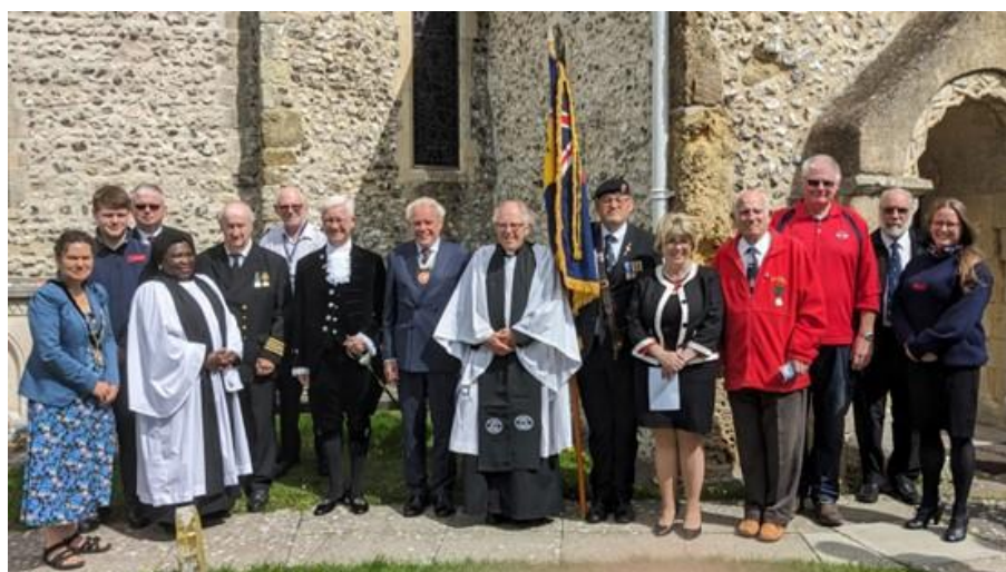
Sea Sunday at St Andrew's

‘Sea Sunday’ service donating the collection to The Mission to Seafarers.