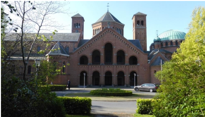
Pilgrimage 2023 (Sint Andries Abbey with the Abbot)