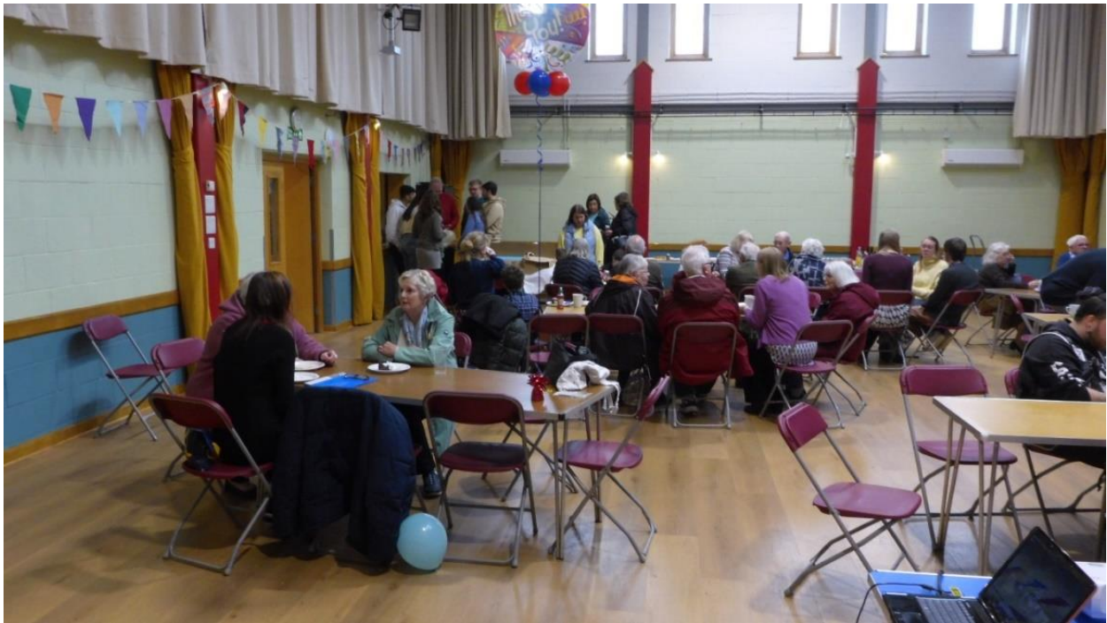
The Meeting Room