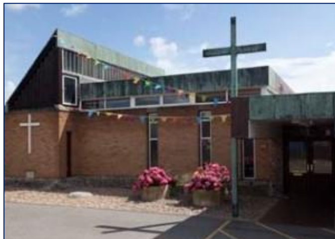
St Wilfrid Pevensey Bay