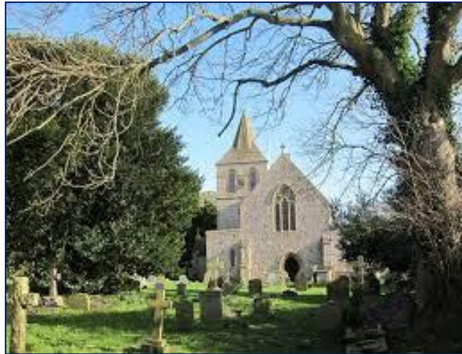
St Nicolas Pevensey