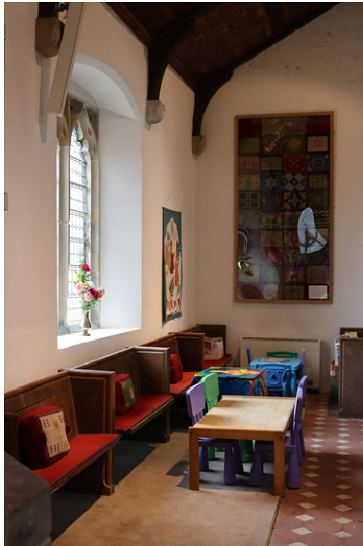
The Children's Area

The building is generally in good condition, with the 2015 quinquennial inspection identifying manageable items for attention. At this time, we took the opportunity to carry out major restoration works to the church building internally and externally. This also included changes to the north and south aisles to create a special children's and event areas. New lighting and electrical supply now meet the latest standards.