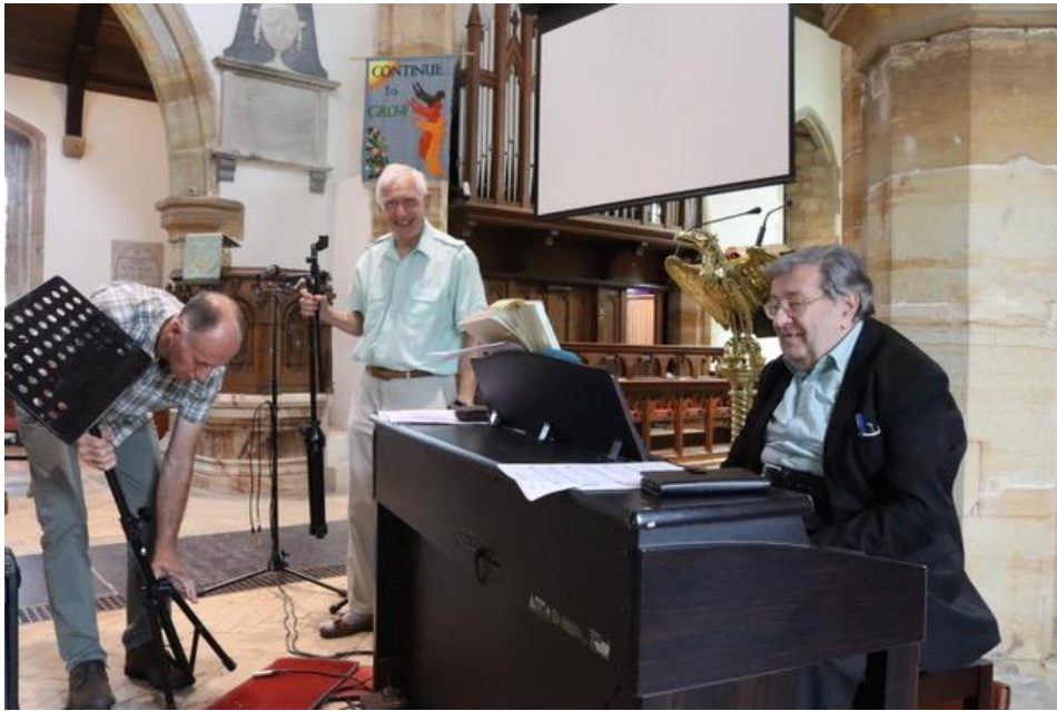
Setting up for the Worship Group is a team effort.

An electric piano is available for worship group use (and for other modern songs). A small worship group which provides for more modern style songs (this only restarted in July 2022 following easing of Covid restrictions).