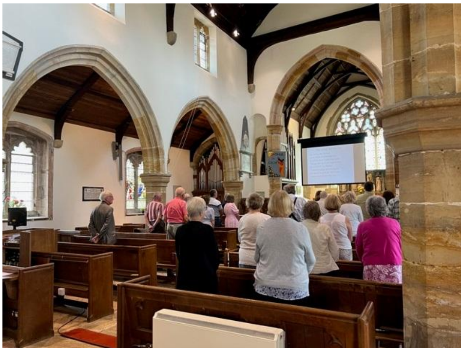
The Church in action – projector in use