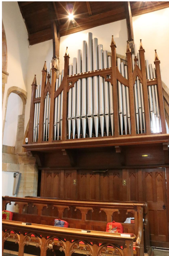
The organ dates from 1900 as was gifted by the Baxendale family

There is a fine well-maintained organ which originated in 1900 as a gift from the Baxendale family. It is a two manual instrument with 22 stops. It is important to keep this instrument in use.