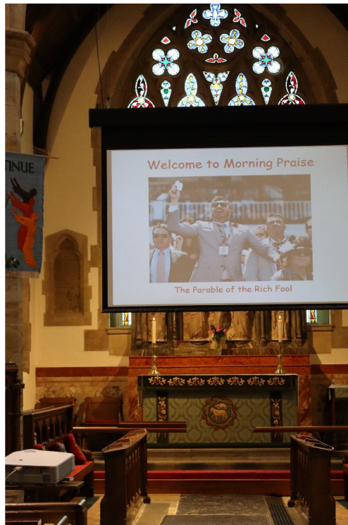
The projection screen in use

We have a comprehensive sound system which has recently been upgraded to allow us to stream services online weekly. This has been made possible by a gift donation of the necessary equipment. The system is broadcast quality. A projection screen is available, which has been sympathetically installed to retract out of sight behind the chancel arch when not required. Therefore, it does not spoil the original ancient lines of the building.