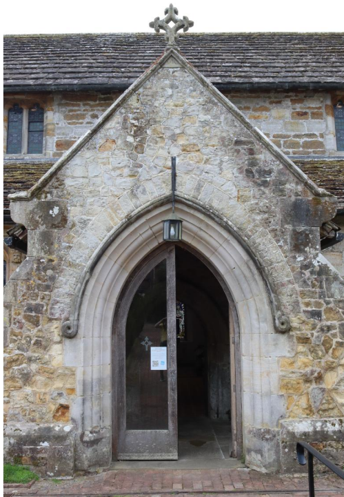
North doors and porch