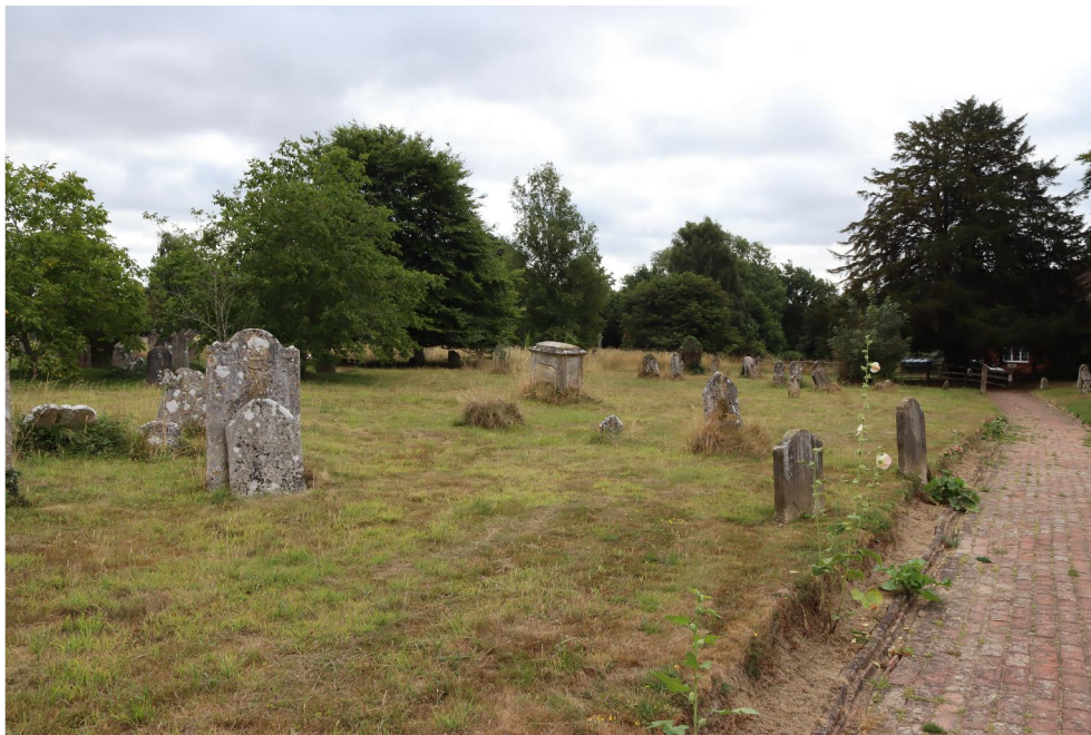
The west edge of the Churchyard – Capability Brown’s “Natural Garden”?

For the last 15 years a Churchyard Management Plan has been implemented by a band of enthusiastic volunteers, composed of church members and others. This Plan, based on an ecological survey in 2007, identifies which areas are to be managed as conservation areas and mown only 2 or 3 times a year, and those areas primarily managed for amenity and mown much more regularly.