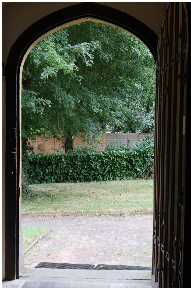
Leaving by the west door

Provision of flowers has good support from the village, with 17 members currently on the rota. New members are always welcome.