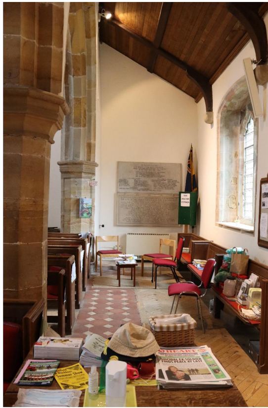
The Prayer Corner at the rear of the church