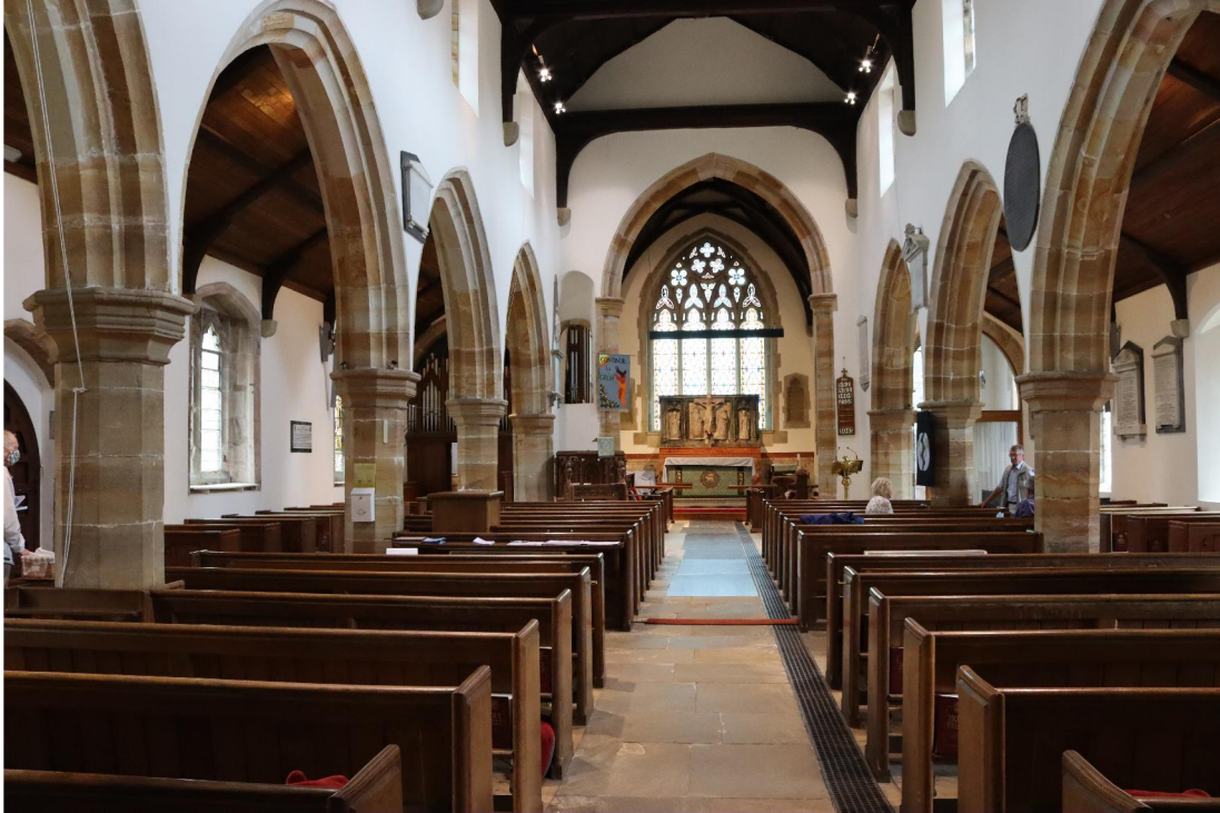
The restoration of 2013 has given the church a bright and airy feel

towards this ongoing work, which has included repairs to the church roof, recasting of the two bells and a substantial restoration in 2013.