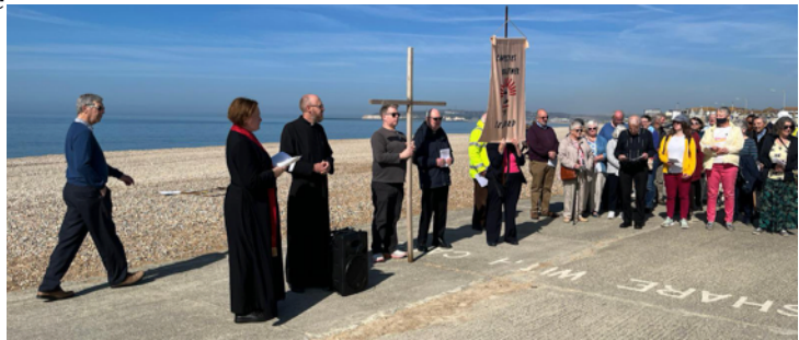
2022 Walk of Witness with Churches Together Seaford

congregation in singing hymns and seasonal settings for the eucharist. There is an active branch of the mothers union and we are keen members of the inter-denominational Churches Together in Seaford.