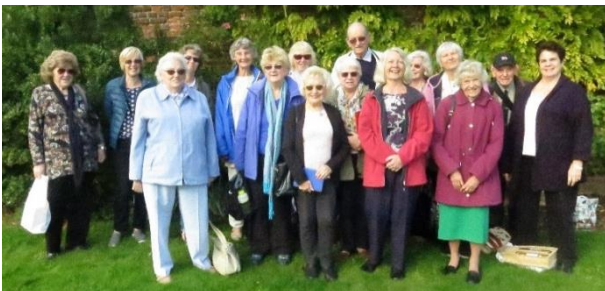
Our trip to Eltham Palace in 2019

Pre pandemic we had a programme of outings which were open to all church members and friends and family and it is hoped to be able resume our outings when the situation allows.