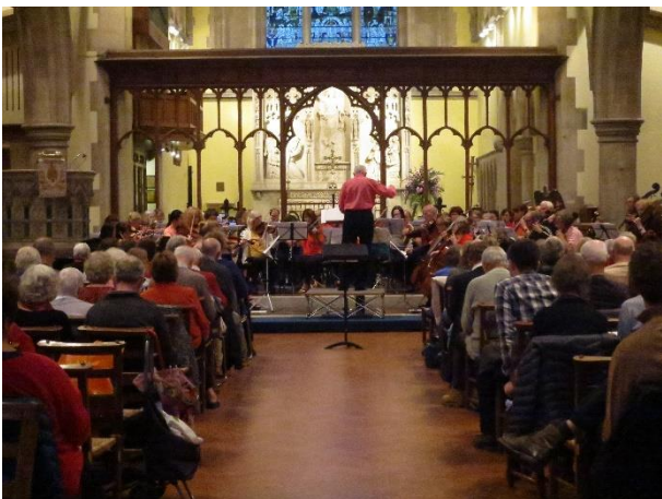
Brighton & Hove Arts Orchestra concert

Most recently, Brighton and Hove Arts Orchestra (a community orchestra) has held both summer and Christmas concerts at St John's. The Christmas concert is free admission with a retiring collection for local charities working with the homeless in Brighton and Hove.