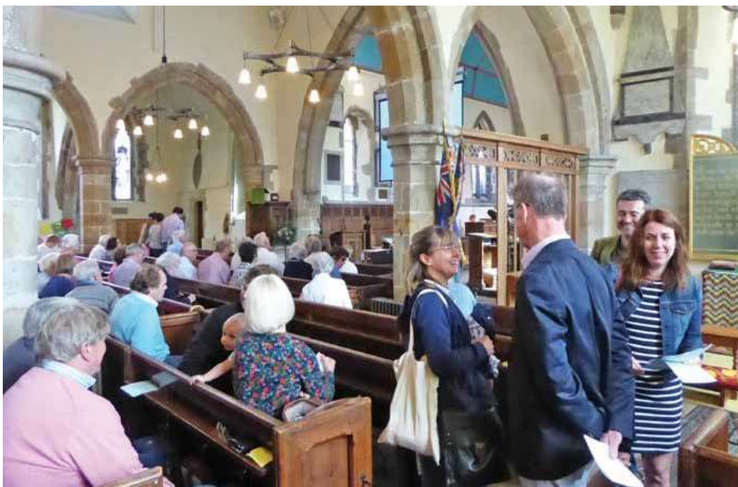
St Peter and St Paul, Wadhurst

Attendance: Based on 2019 pre-COVID attendance figures, the average attendance at Wadhurst was 19 adults at the 8am service and 90 adults and 20 children at the main service. At Tidebrook the average attendance was 25 and at Stonegate 18. Attendance at festival services is much higher. During the pandemic we have been posting pre-recorded services online and these have been very popular attracting hundreds of viewings each week.