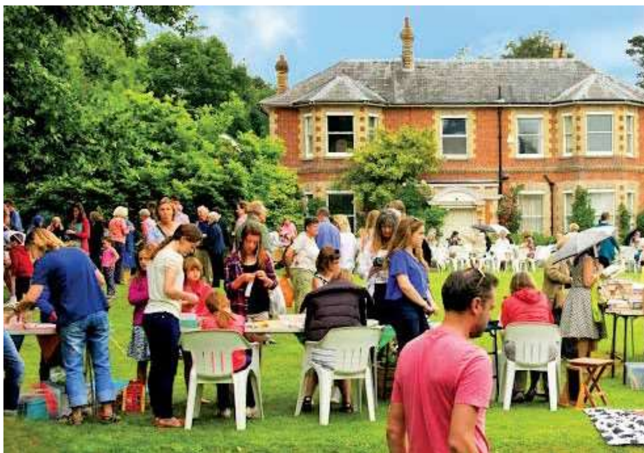
Annual Tidebrook Fete