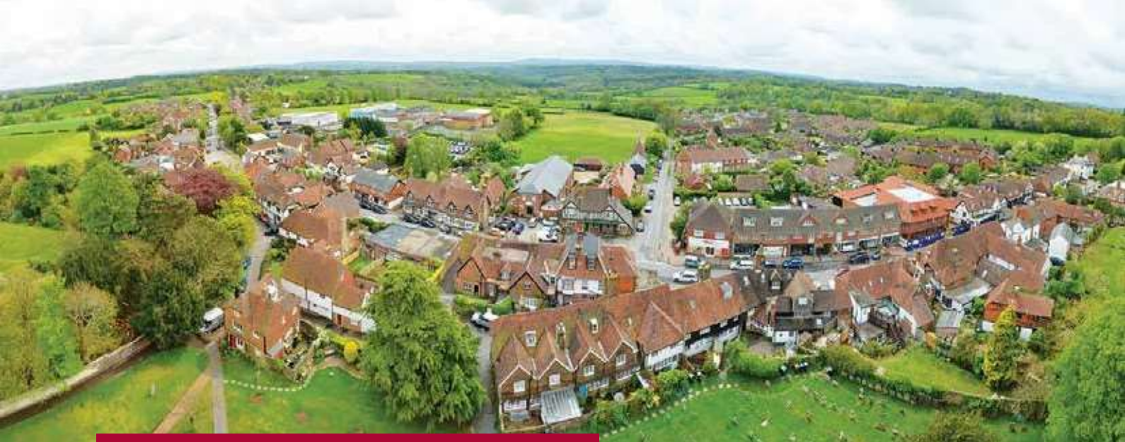
View from the Church Tower towards Bewl Reservoir.

move away, resulting in individuals in their 20s being under represented compared to the national average. However, young professional couples often arrive when they start a family. There are also long-time residents and extended families still living near one another.