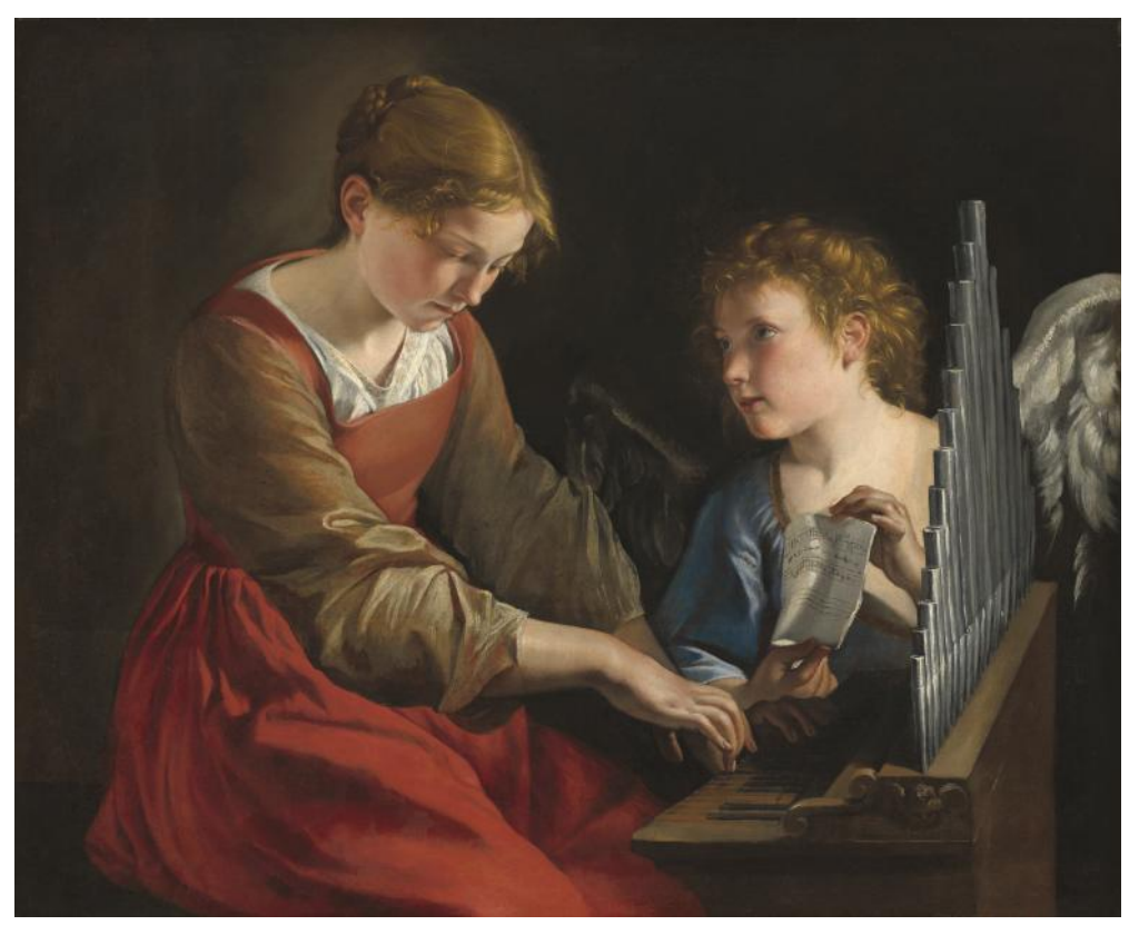
By Orazio Gentileschi / Giovanni Lanfranco - This file was donated to Wikimedia Commons as part of a project by the National Gallery of Art. Please see the Gallery's Open Access Policy, CCO, https://commons.wikimedia.org/w/index.php?curid=81329849

The course will also cover how to make the most of available resources - whether recordings, local talent, or community assets - and how to design meaningful and inspiring music choices and fully engage with your congregation and community.