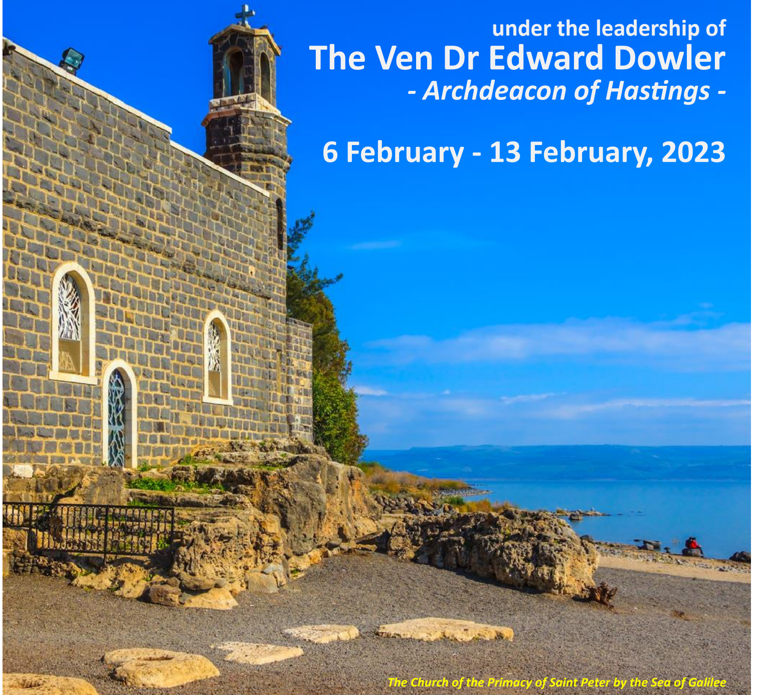
The Church of the Primacy of Saint Peter by the Sea of Galilee