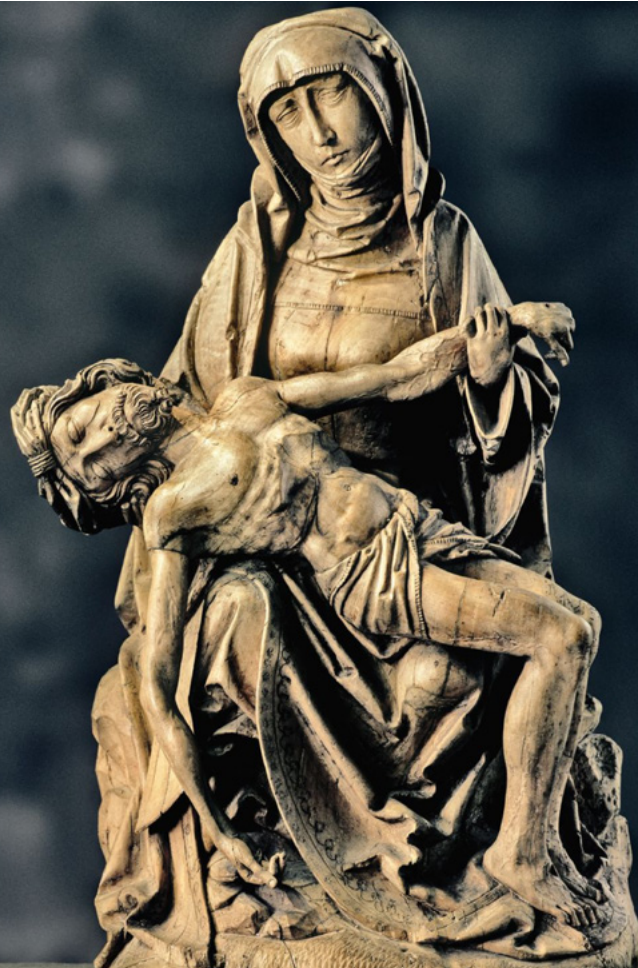
TILMAN RIEMENSCHNEIDER The Lauffer Pieta