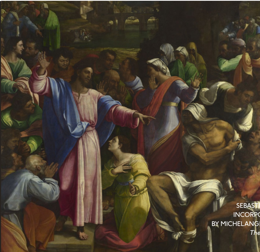
SEBASTIANO DEL PIOMBO INCORPORATING DESIGNS BY MICHELANGELO BUONARROTI The Raising of Lazarus