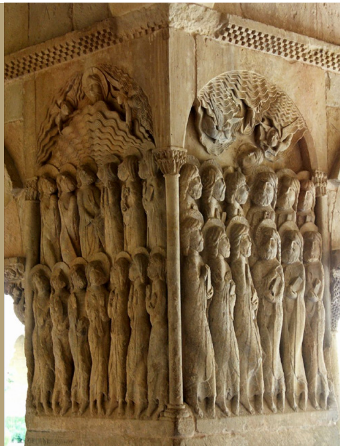
UNKNOWN ARTIST Ascension and Pentecost, Late 11th century, Stone relief sculpture, Cloister of the Monastery of Santo Domingo de Silos, Spain,